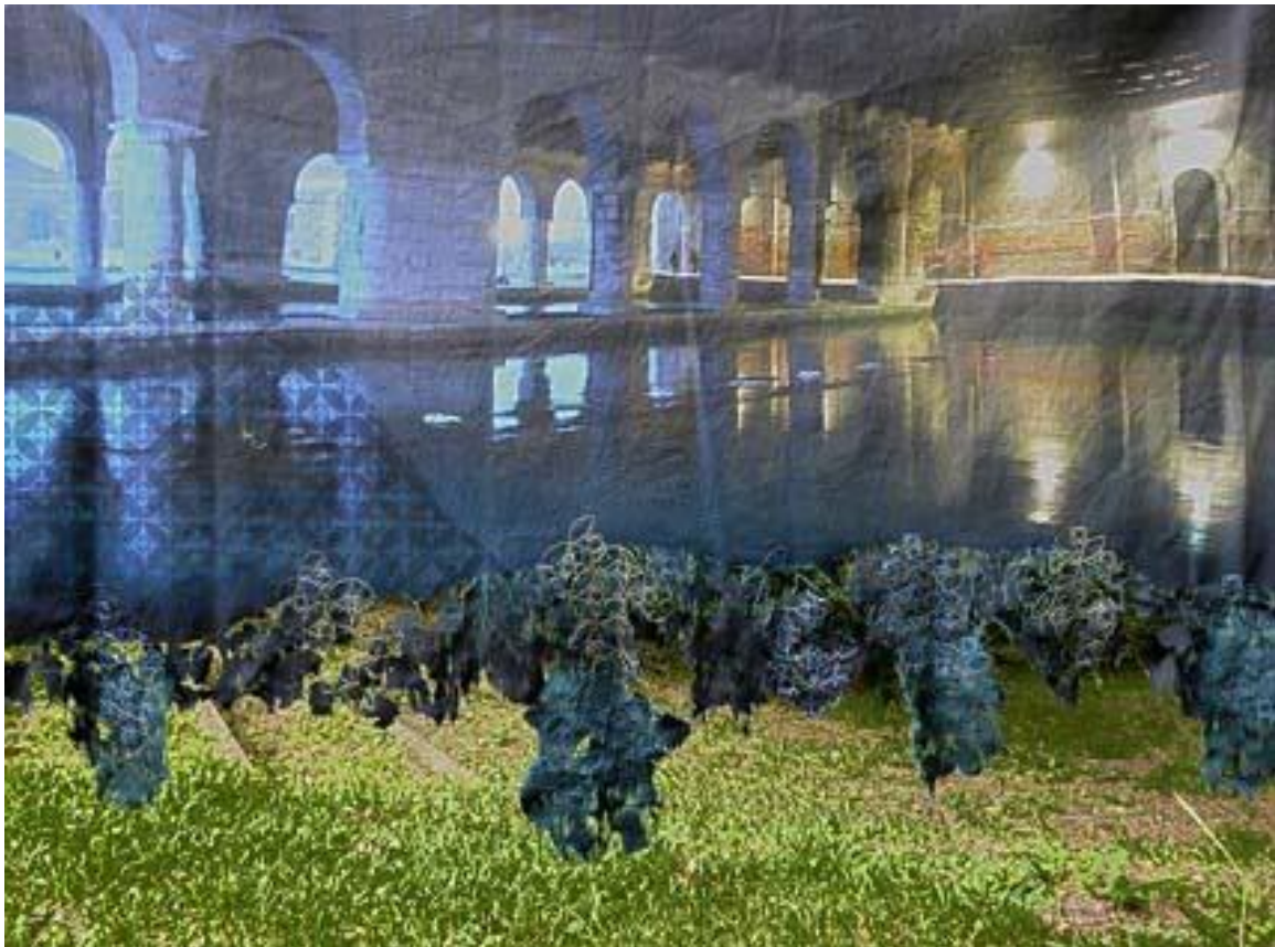
Reflections on Venice 181 x 61 cm. Digital print, silkscreen, dévoré, embroidery, dyes on linen

Destructured fabrics and broken images using the techniques of silkscreen printing, dévoré, gilding, monoprinting, embroidery and painting that evoke memories of her visits to Fortuny exhibitions in Paris and Venice and the uncertainty of the city's future.