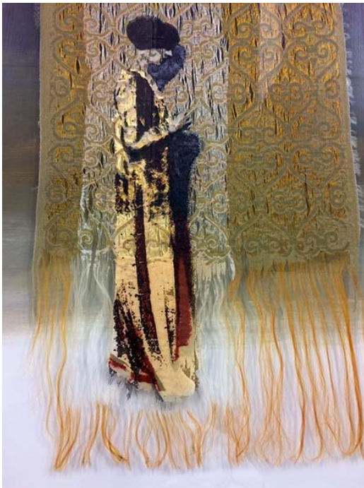
La Contessa 79 x 62.5cm. Silkscreen and devore, wooden frame with glass, 23 ct. Gold leaf, silk and viscose