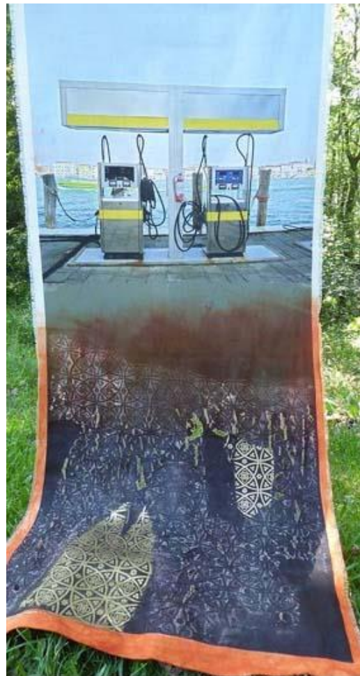
Essence de Venise 182 x 71 cm. Digital print, devore, pigment on linen