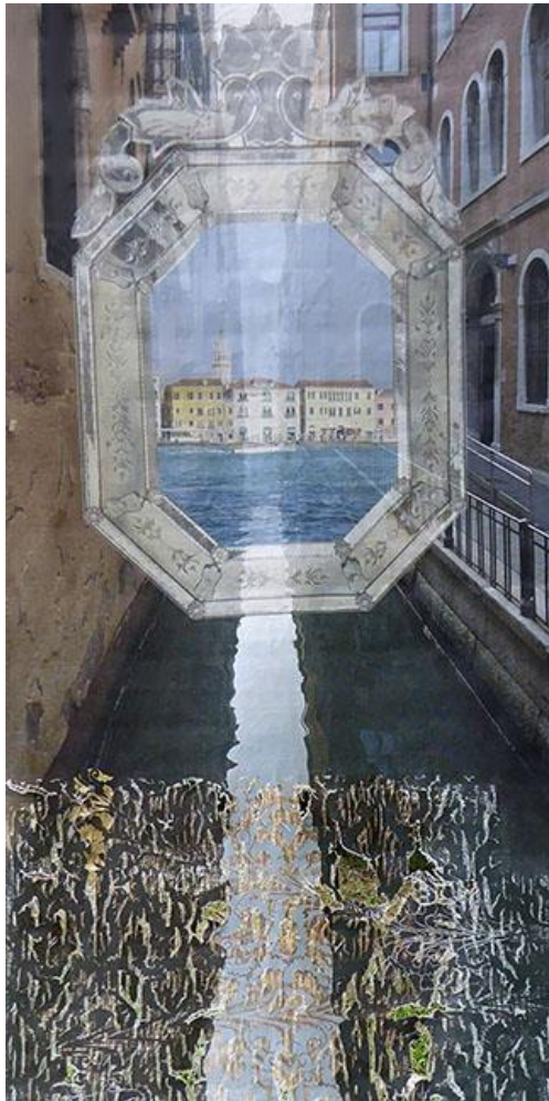
Reflections on Guidecca 181 x 61 cm Digital print, devore, embroidery on linen